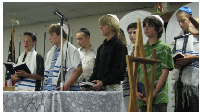
The Religious School graduating class of 2007 leads the June 1 service