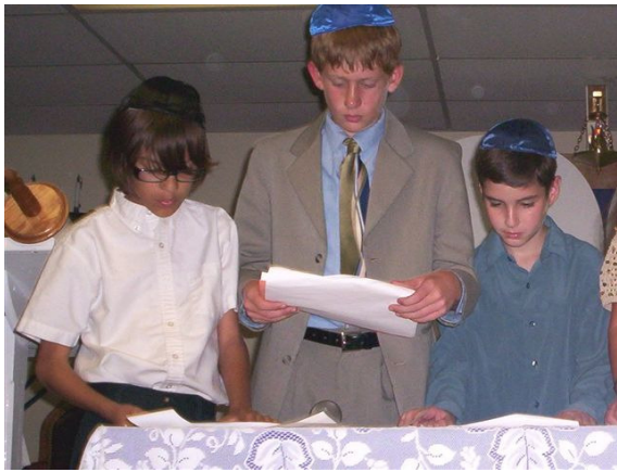
Fifth grade boys help lead June 18 service