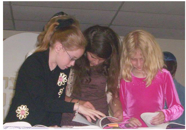
Fifth grade girls examine their new siddurim.