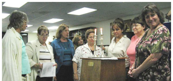
The Incoming Board of Women of CBE light the Shabbat candles at Sisterhood Shabbat on May 11