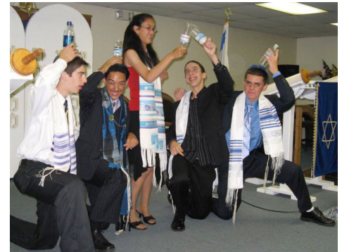
Confirmands of 2007 as bottle dancers

Dear Confirmation graduates and families,