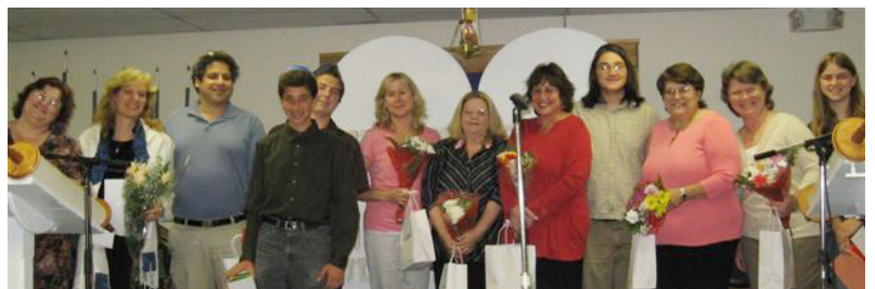
CBE Religious School Staff honored at the June 1 service