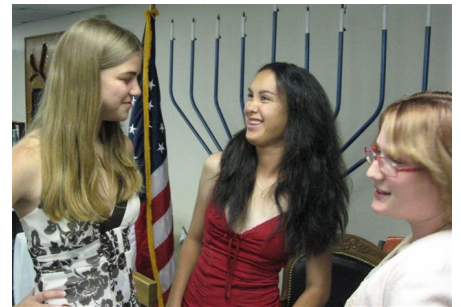
Judaica High Women at June 8 service