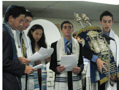
The confirmands lead the Torah service on June 8