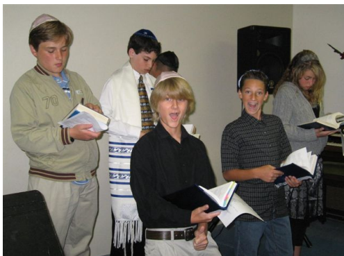
Graduating students rehearse for June 1 service