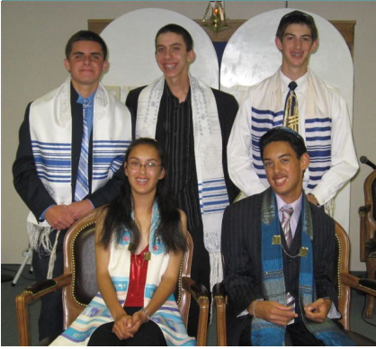
Official Confirmation photo