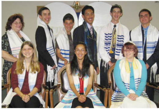
Official Judaica High class photo