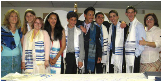
Judaica High class after leading the June 8 service