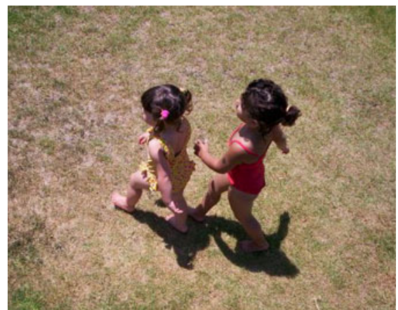
Little girls on the march