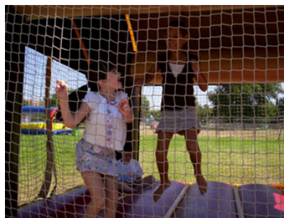
Children enjoying the Moon Bounce