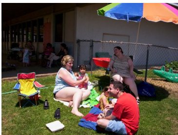
Families relaxing and enjoying the Carnival