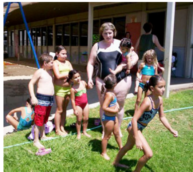
Kids line up to go on the Slip 'n' Slide